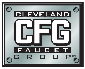
A Moen Incorporated Brand