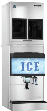
FD-650M_J-C on DM-4420N