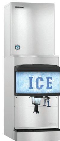
FS-1022MLJ-C on DM-4420N