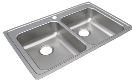
Shown with one-hole configuration. Other configurations available.

Quality Grade Plumbing Products. Since 1933 we have become the industry standard for designing and producing quality grade plumbing products and fixtures. Our role as an industry leader remains unsurpassed.