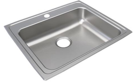
Shown with one-hole configuration. Other configurations available.