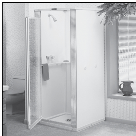
Model 80 shown with optional glass door.