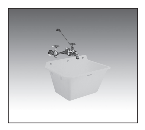
Shown with optional 63.600A Mop Service Faucet