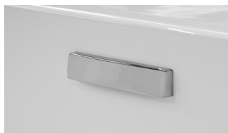
Rectangular overflow included

Slim-Line Overflow with Toe Tap Drain Solid Brass Drain Chrome (SLOTSBC) $930 Brushed Nickel (SLOTSBBN) $935 Polished Nickel (SLOTSBPN) $935 White (SLOTSBW) $965