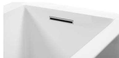
Optional Slim-Line overflow