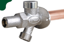
P-264 Loose Key Design