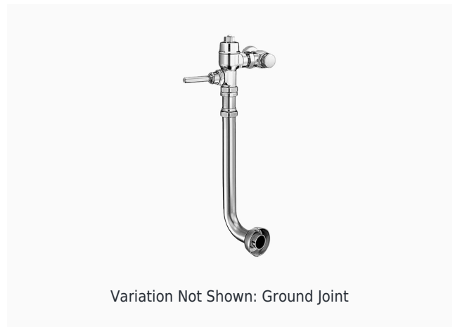
Variation Not Shown: Ground Joint