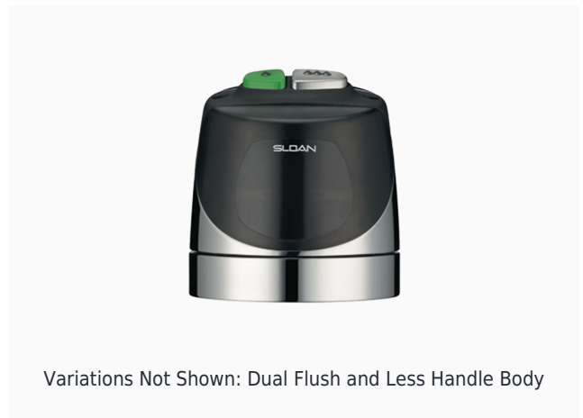
Variations Not Shown: Dual Flush and Less Handle Body