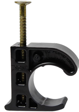
556-2 Patent # 7,207,530